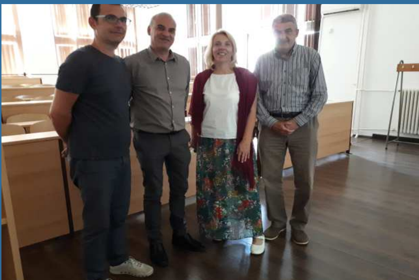
Department for Microbiology and Immunology