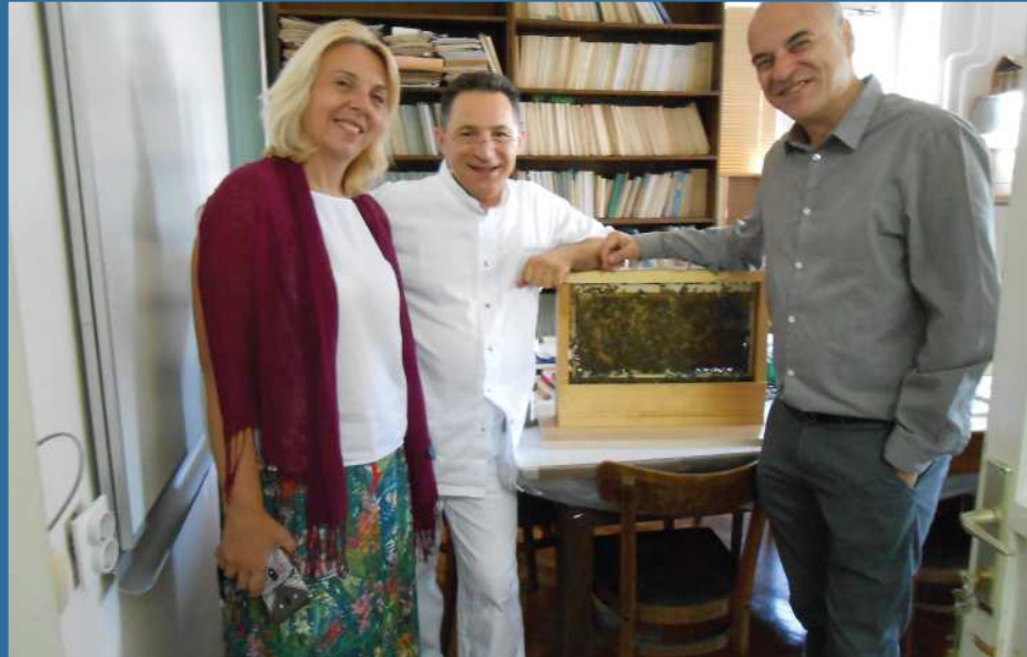
Department for Ruminants and Swine Diseases