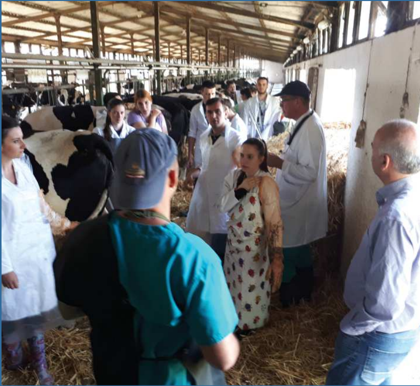
Visit at the PKB farms – Teaching base of FVM