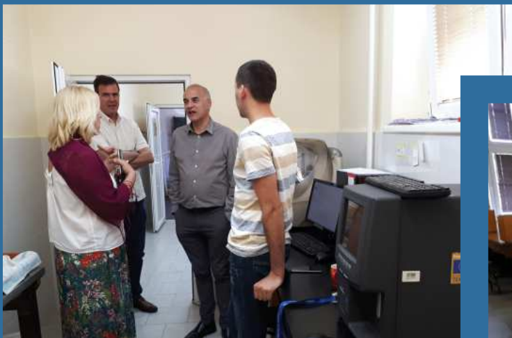
Department of Histology and Embryology