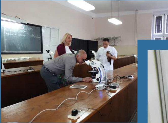
Department of Biology