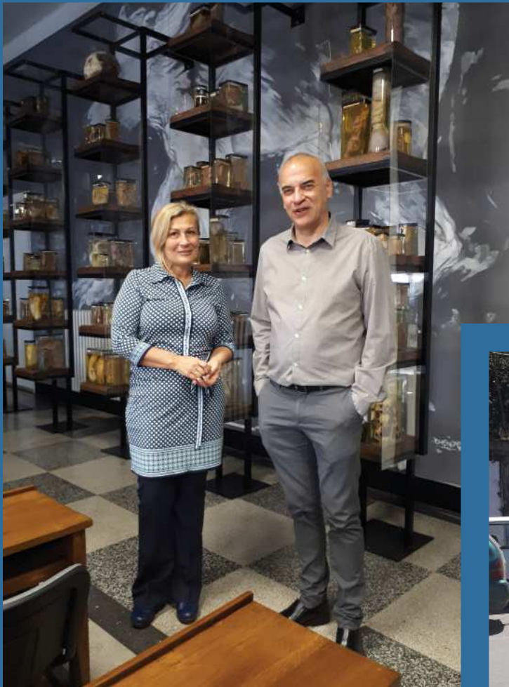
Department of Pathology